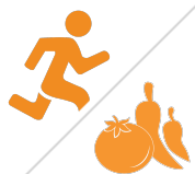
Diet & Exercise